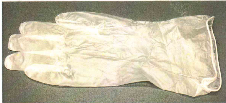
Photo: Disposable Vinyl Powder-Free Examination Gloves, Brand/Model: BS 015-02